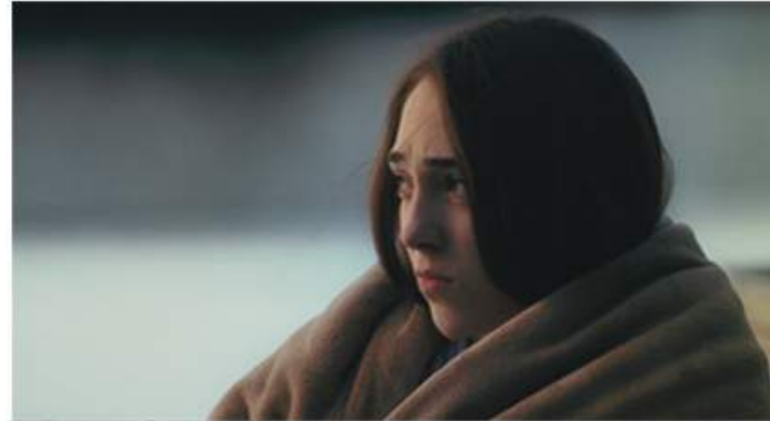
BRIANNA D'AGUZZO Deanna

Maša Lizdek was born in Vienna, raised in former Yugoslavia and migrated to Canada during the civil war. Maša is known for her guest star appearances on 'The Detail' (2018), 'Man Seeking Woman' (2015) and 'Murdoch Mysteries' (2013). Lizdek also starred in 'The Waiting Room' (2015) as Sanja (supporting lead), performing in Serbo-Croatian. The film was nominated and screened at Toronto International Film Festival, Locarno International Film Festival and several others.