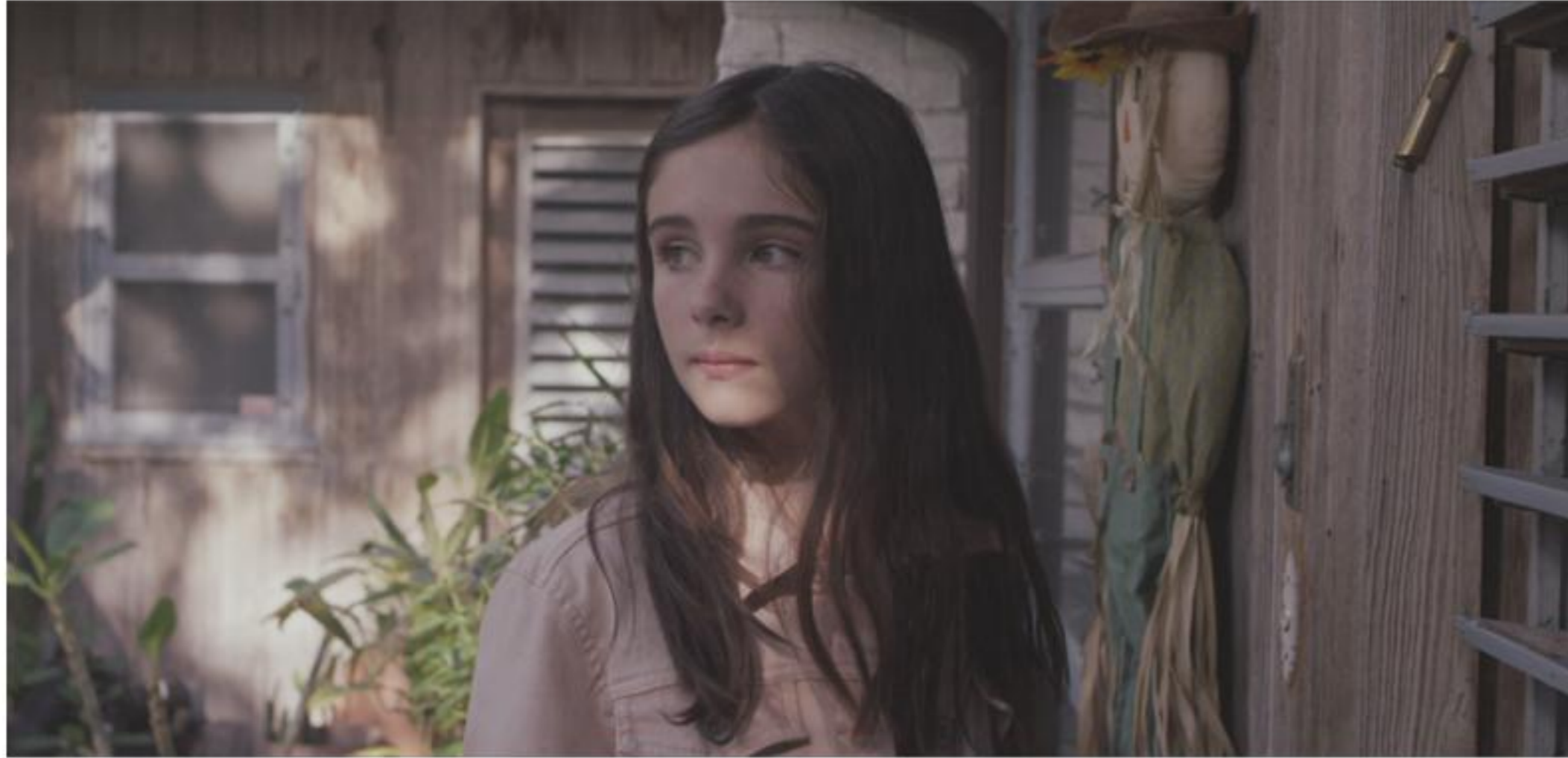
FROM THE MOVIE