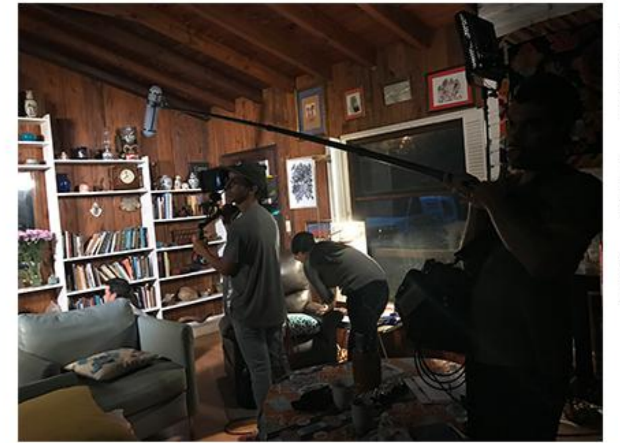
FROM THE SET